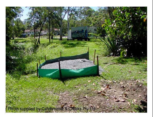
Photo 2 – Combined aggregate and filter fence sediment control system