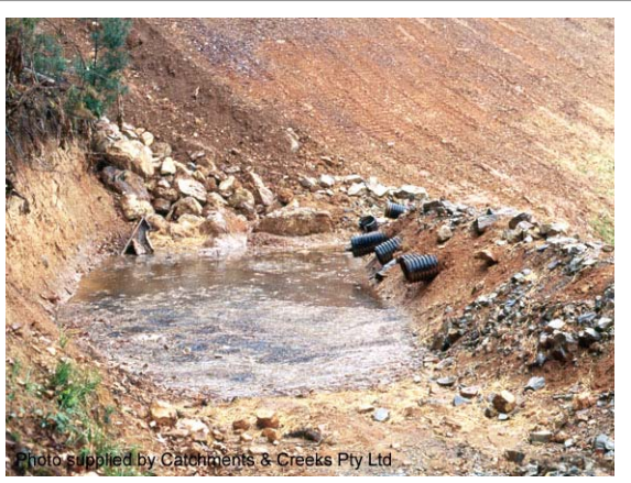
Photo 4 – Slope drains (right) used as an outlet structure for a sediment trap