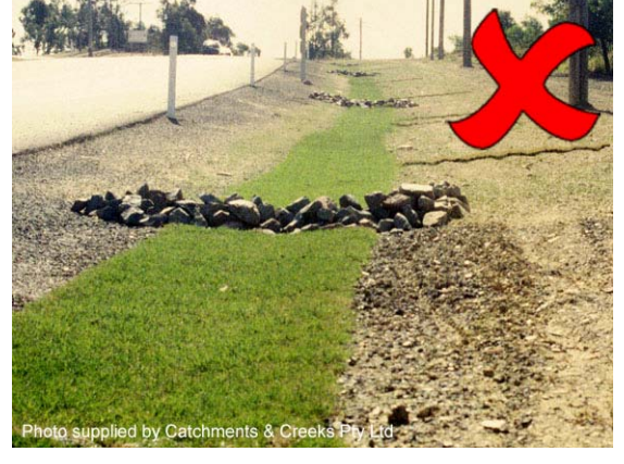
Photo 8 – Check dams and sediment traps placed on turfed drains can cause flow bypassing and erosion (rilling) along the edge of the turf