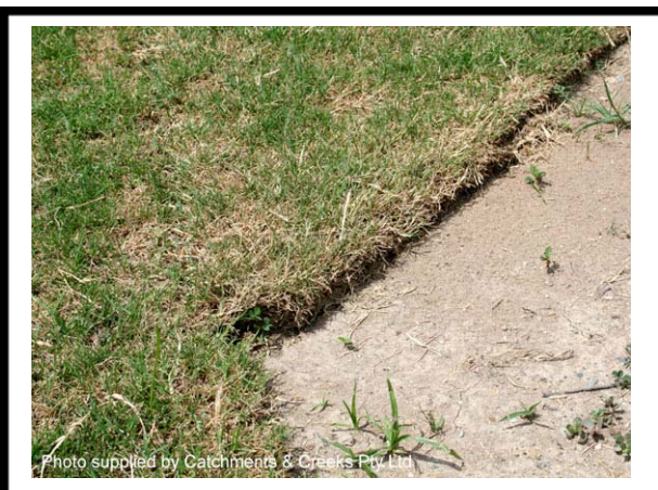
Photo 3 – Example of up-slope edge of turf that can redirect water flow