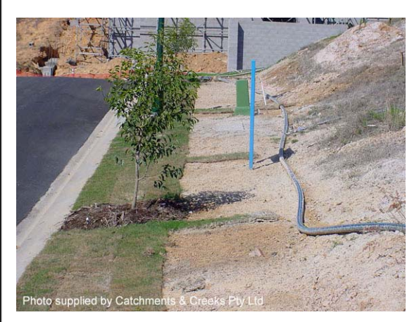
Photo 5 – Lateral turf strips can reduce the risk of flow diversion along up-slope edge of turf