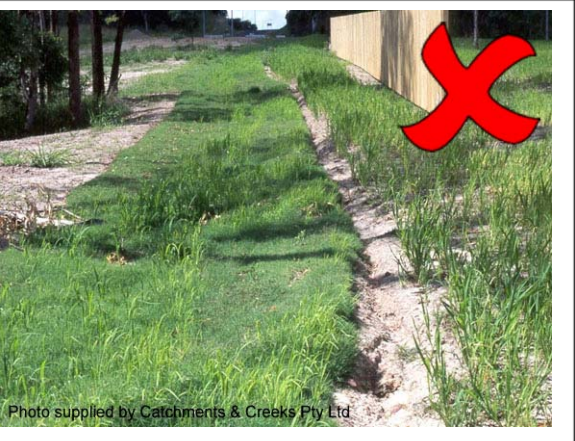
Photo 4 – Undesirable rilling along edge of turf caused by lateral inflows