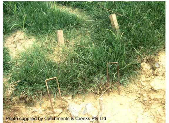
Photo 6 – Turf should be anchored with wooden pegs, not metal staples