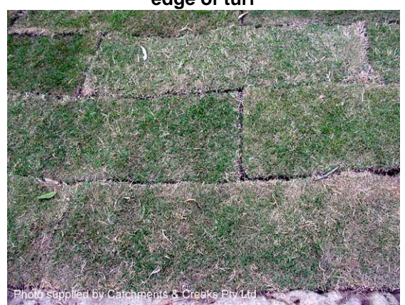
Photo 7 – Placement of turf in a 'stretcher bond' form to reduce the risk of rill erosion occurring between individual strips of turf (flow is from top to bottom of photo)