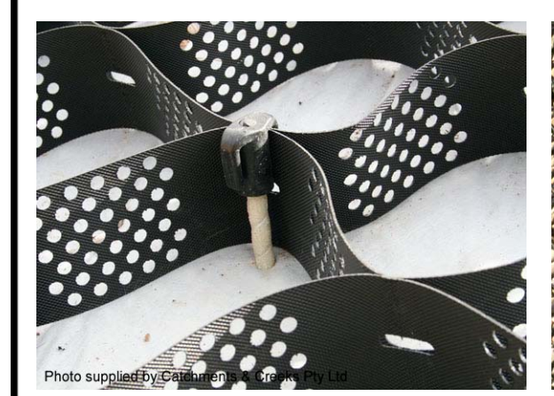
Photo 1 – Expandable, perforated sidewall, cellular confinement system