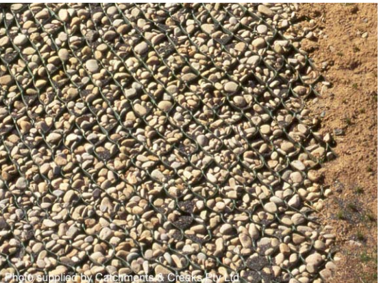
Photo 2 – Cellular confinement system integrated with rock mulching used as a form of erosion control