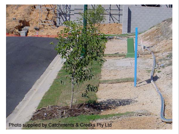
Photo 6 – Example of grass filter strips with lateral turf strips used to reduce the risk of rilling along the up-slope edge of the turf

Photo 5 – Turfed roadside verge used as a grassed filter strip