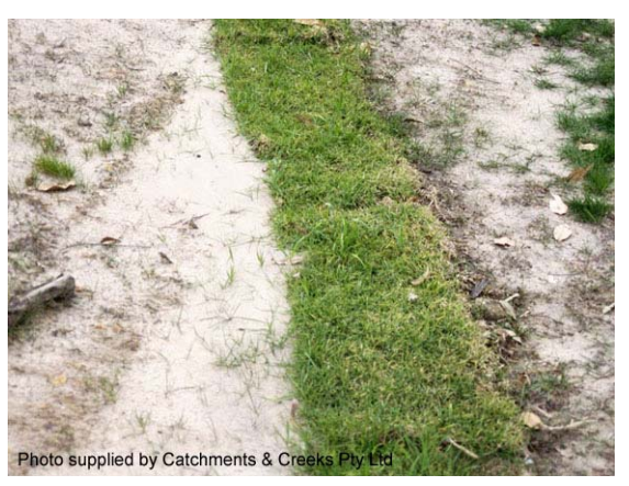
Photo 2 – Grass filter strip placed along the contour on a sandy soil