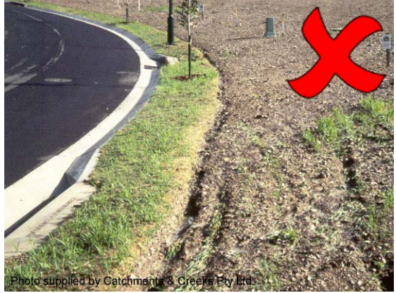
Photo 8 – Example of rilling caused by surface runoff being diverted along the upslope edge of the turf