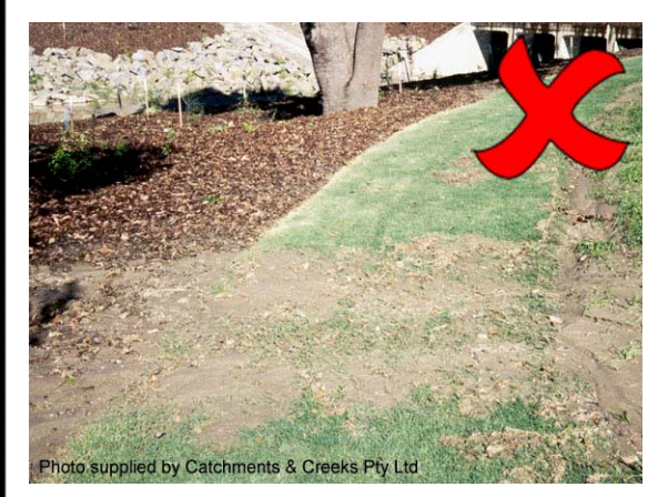
Photo 7 – Grassed filter strips will not function if flows are allowed to concentrate through the grass