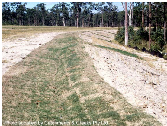
Photo 10 – Turf-lined flow diversion bank with grass-lined outlet chutes at regular intervals along the embankment