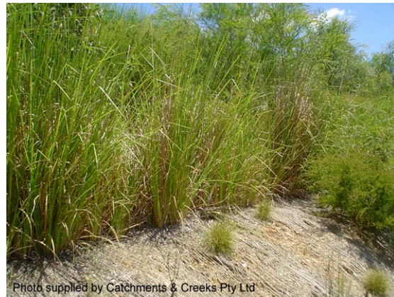
Photo 2 – Vetiver grass placed in rows down the face of a detention basin embankment