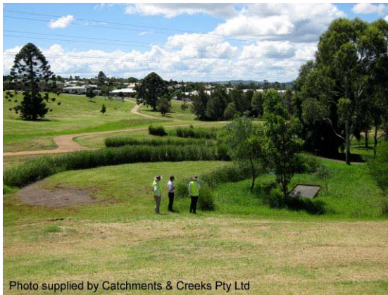
Photo 1 – A series of curved ‘vetiver grass’ check dams at the outlet of a grass swale (right)